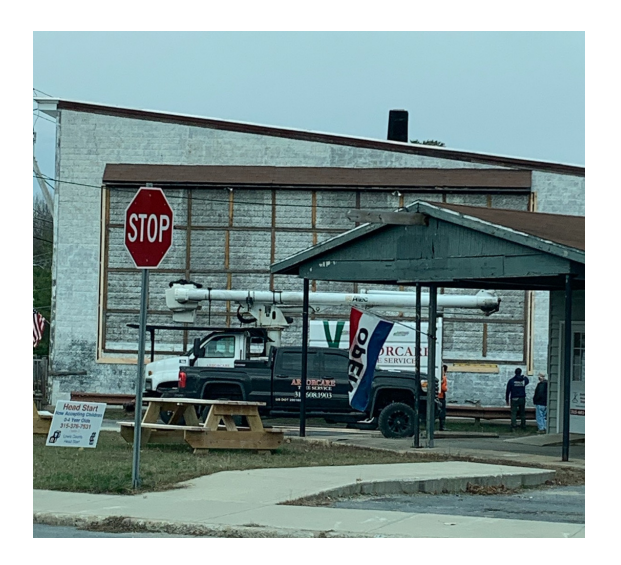
Before the mural installation with the frame already in place.